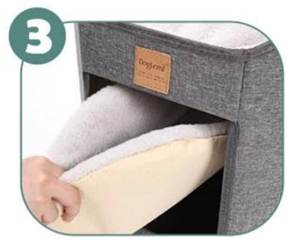
put the cushion inside and on top