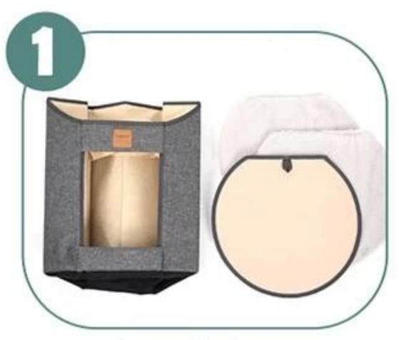
Set up the house