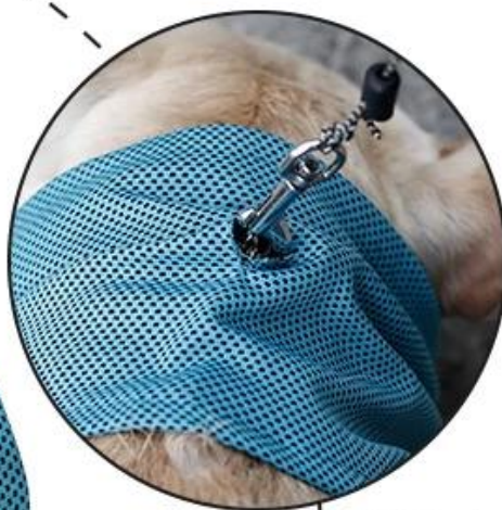
With Leash Hole