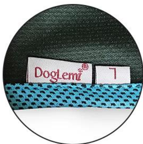
DogLemi fabric label