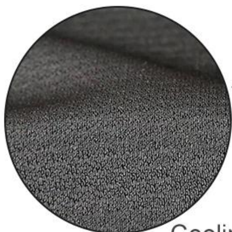
Cooling Touch Fabric