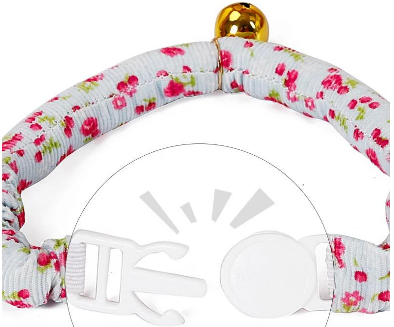
Quick Released Safety Buckle