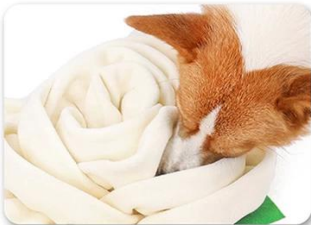
3.Let the dog play