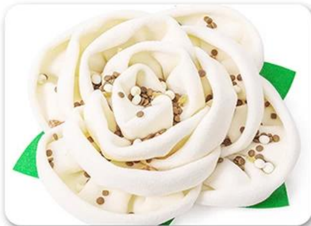
4.Can use as snuffle bowl