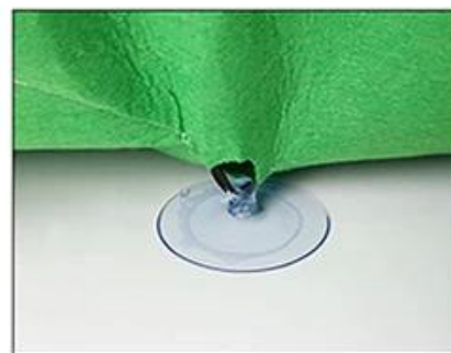
3.with suction cup on bottom