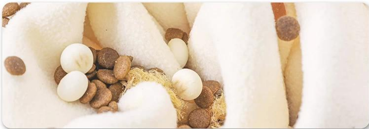
1.Hide the food