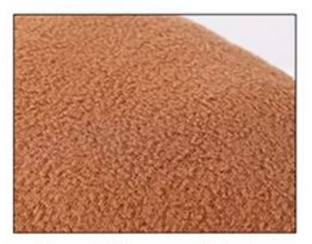
3.soft fleece fabric