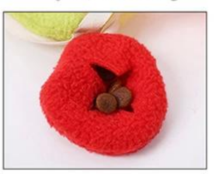
2.multi areas for hiding pet treats or foods