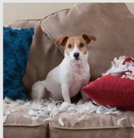
03 Destroy furniture