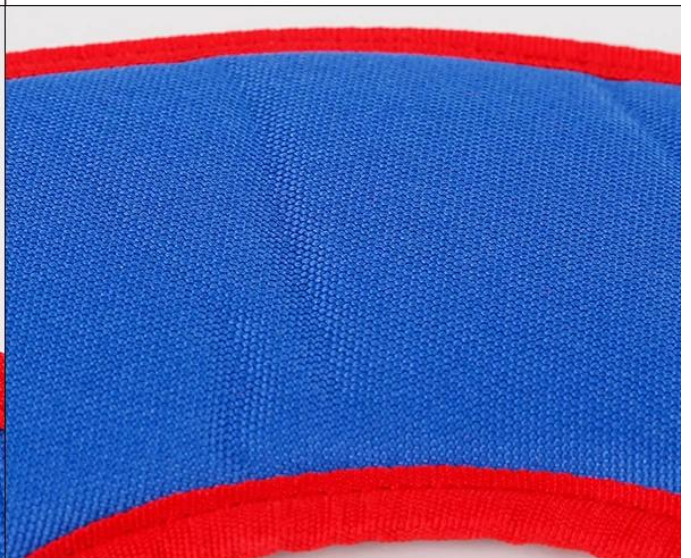
Water resistant oxford fabric Soft foam