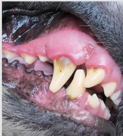
02 Dental problems