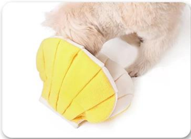
3.Let the dog play