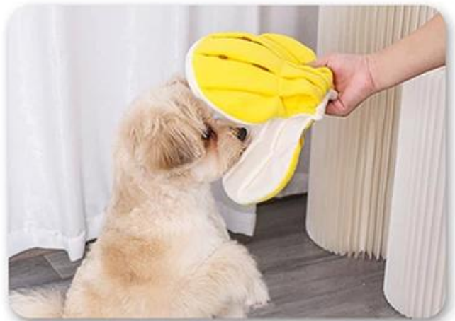
4.And interact with dog