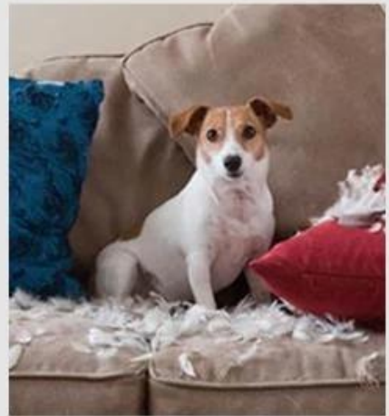
03 Destroy furniture