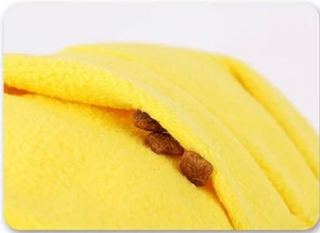
1.Hide the food