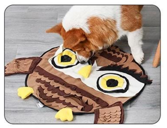
3.Having fun with snuffle training