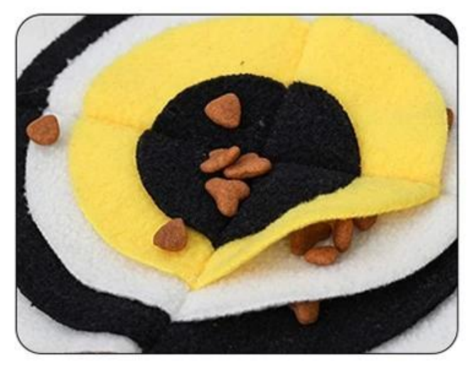
1.Hide some dog food inside