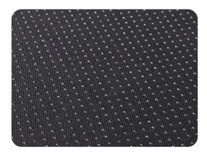
••• Anti-slip bottom