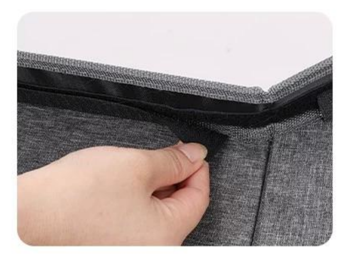
Hook and loop fastening for easy installation