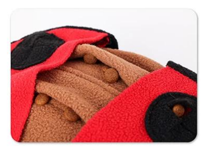
1. Hide the food