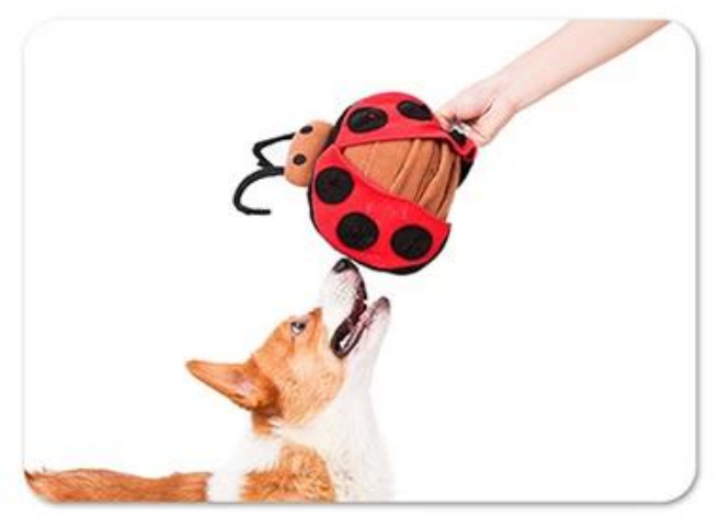
4.And interact with dog