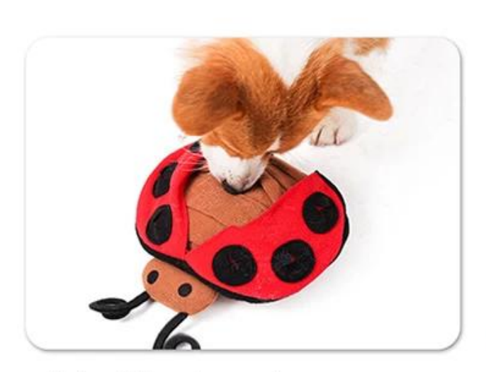
3.Let the dog play