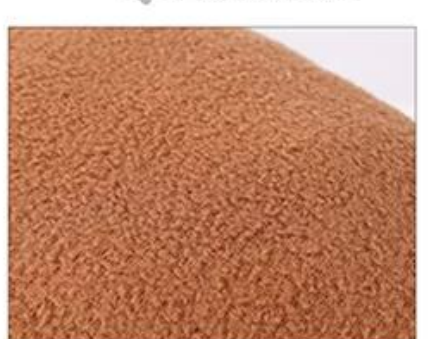
3.soft fleece fabric