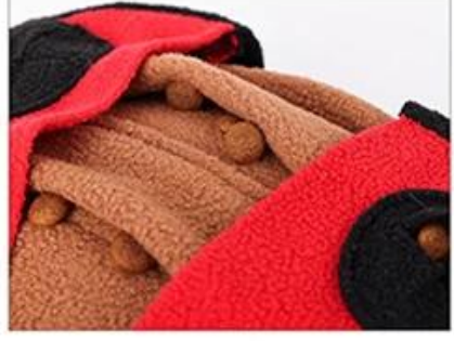
multi areas for hiding pet treats or foods