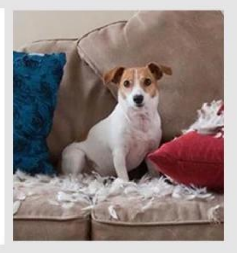
03 Destroy furniture