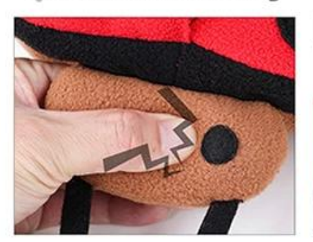
1.with squeaker inside can use as pet chew toy