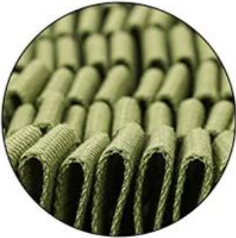
Dense area snuffle