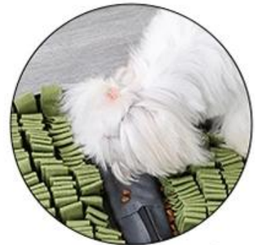
A necessity for cleverer dogs