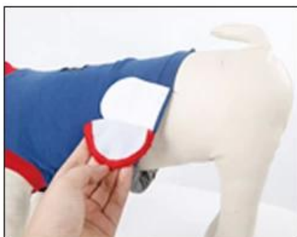
3 put on the velcros without crossing the back legs