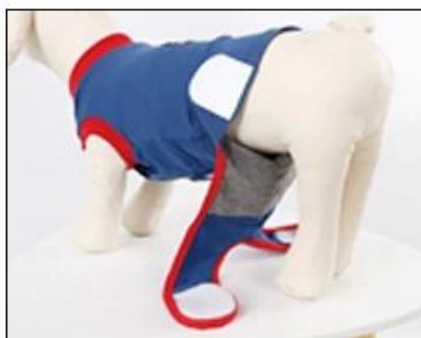
2 take off the velcros