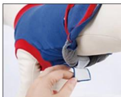
4 roll up the belly part to fix with front velcro.