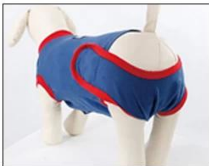
1 suit under normal use