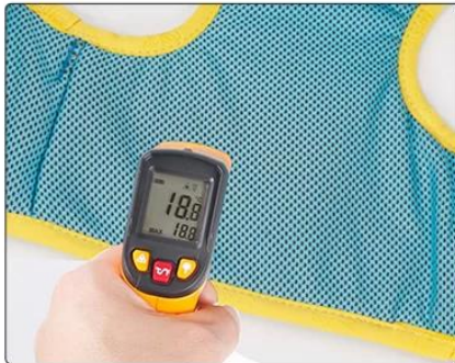
Annnnd, it cools!