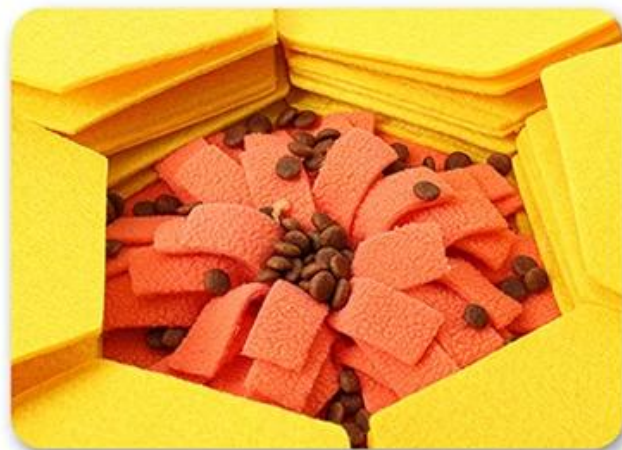
4.Can use as snuffle bowl