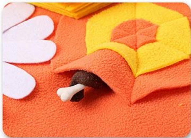
1.Hide the food