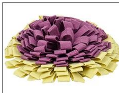
2.Medume level option