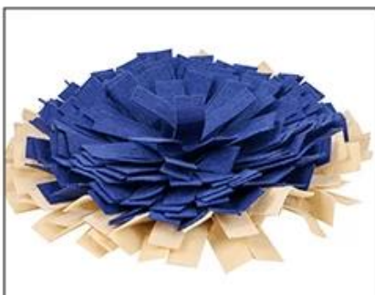
1.Low Level option