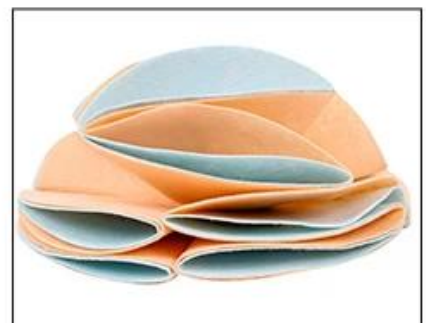
3.High level option