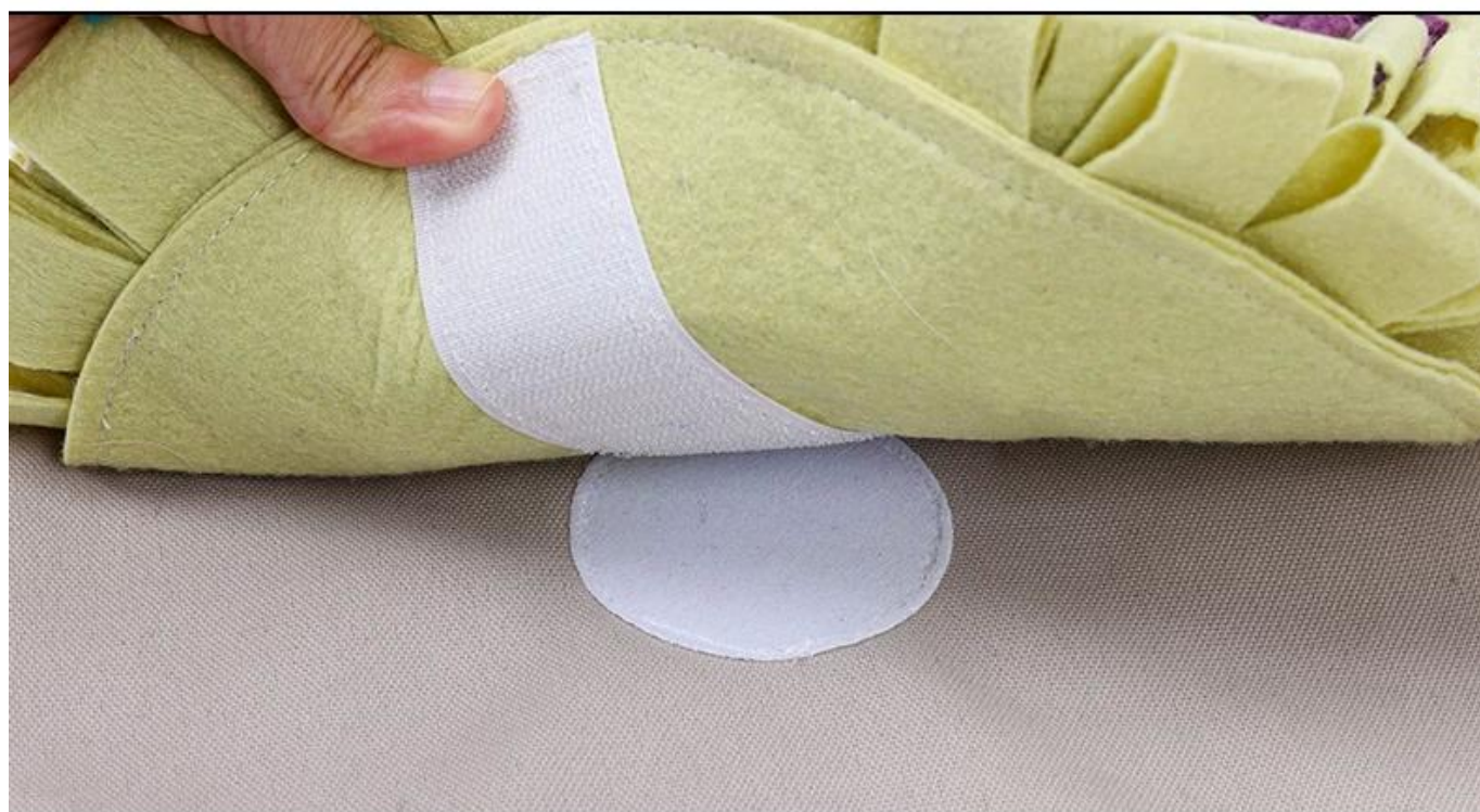
Soft closure for fitting snuffle parts