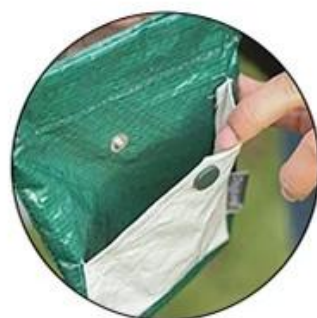
Front pocket attached