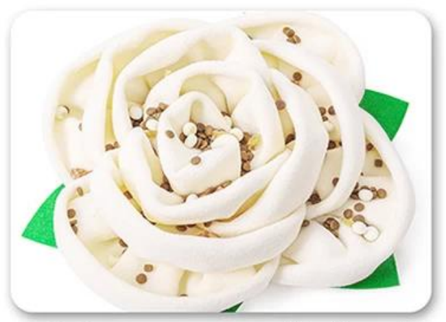
4.Can use as snuffle bowl