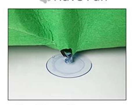
3.with suction cup on bottom