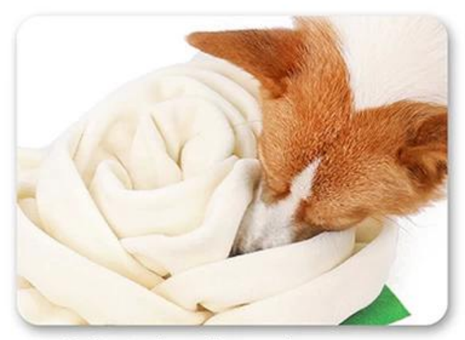
3.Let the dog play