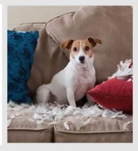
03 Destroy furniture