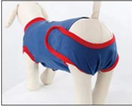
① suit under normal use