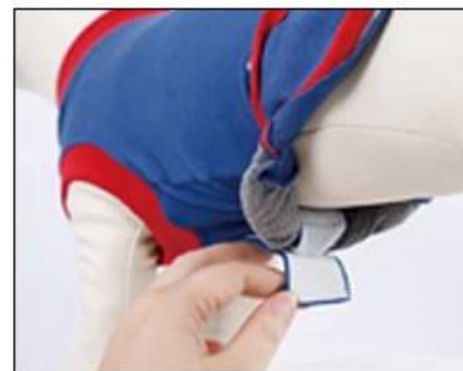
④ roll up the belly part to fix with front velcro.