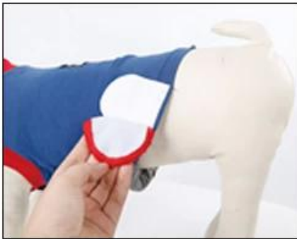
③ put on the velcros without crossing the back legs