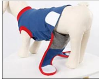
② take off the velcros