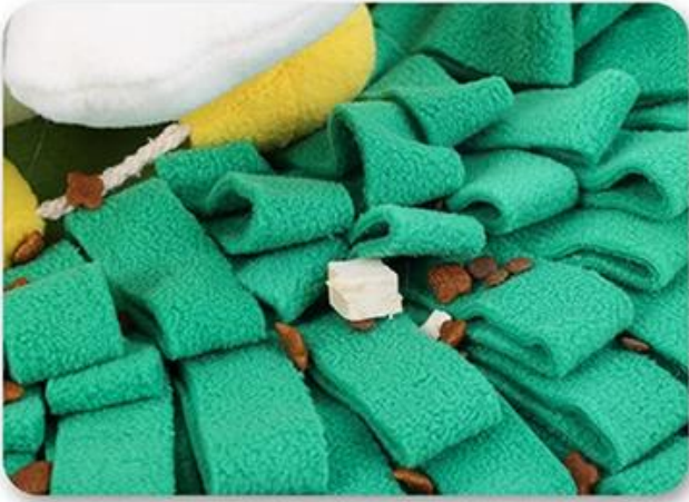
1.Hide the food