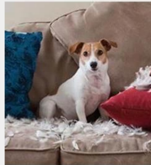
03 Destroy furniture