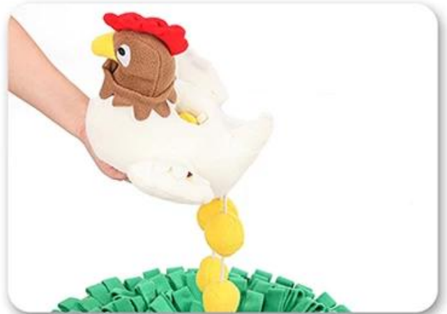
4.multi functions puzzle toys and snuffling mat