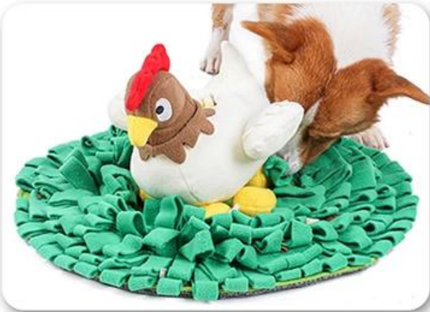
3.Let the dog play