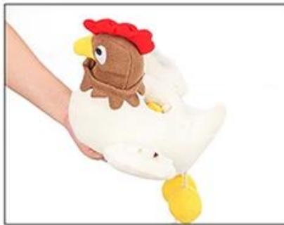
2.chicken hatching eggs design