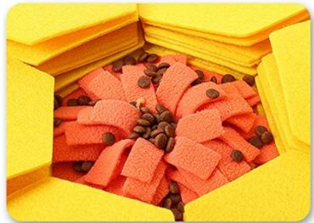
4.Can use as snuffle bowl