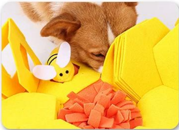
3.Let the dog play