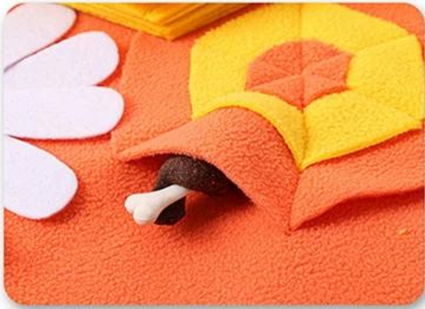
1.Hide the food