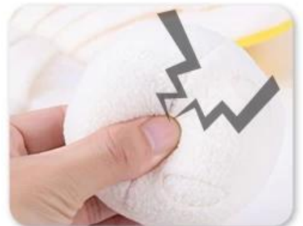
3. with squeaker