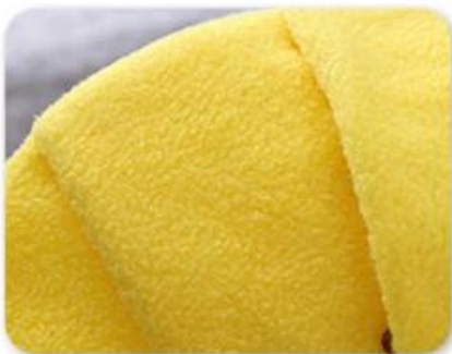
1. Soft fleece fabric