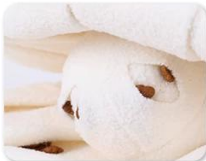
2. Multiple pockets for hiding snacks or kibbles