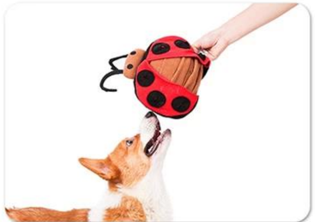
4.And interact with dog