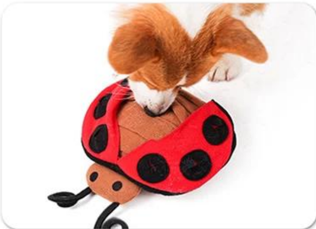
3.Let the dog play