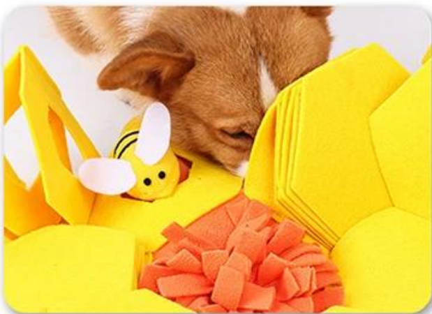
3.Let the dog play