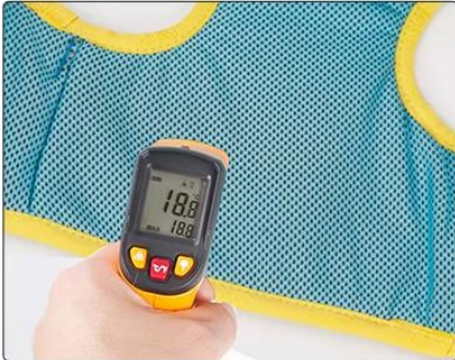
Annnd, it cools!