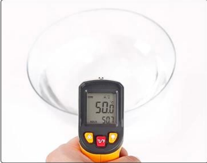
50°C/122°F warm water