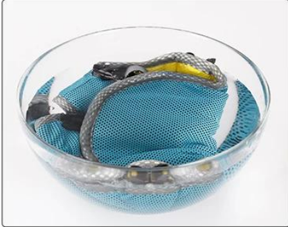
Cooling Touch Fabric