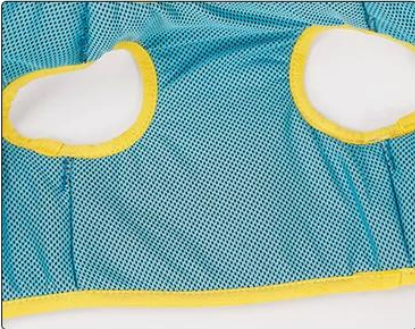
Snap it three times in the air